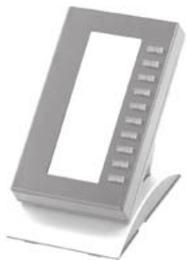
Add-On Module LCD key labels 10 programmable buttons LM5110