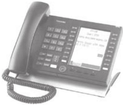
9-line Backlit LCD 20 programmable buttons and LCD key labels and integrated browser IP5131-SDL

Whether you are outfitting your executive offices, upgrading your call center, enhancing communications at a branch or virtual office, or gearing up a receptionist station, Toshiba's IP5000 series has solutions for any need across your enterprise. Convenient add-on modules let you enhance functionality for even greater flexibility.