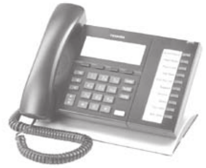
4-line Backlit LCD 10 programmable buttons (available with or without local CO line interface) IP5122-SD or IP5122-SDC IP5022-SD (non backlit) LCD