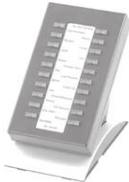
Add-On Module 20 programmable buttons KM5020